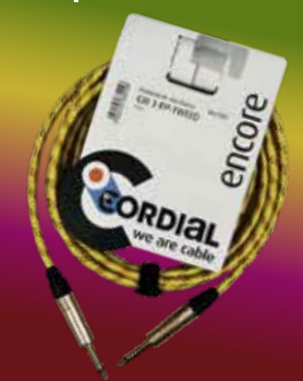
CXI PP TWEEED